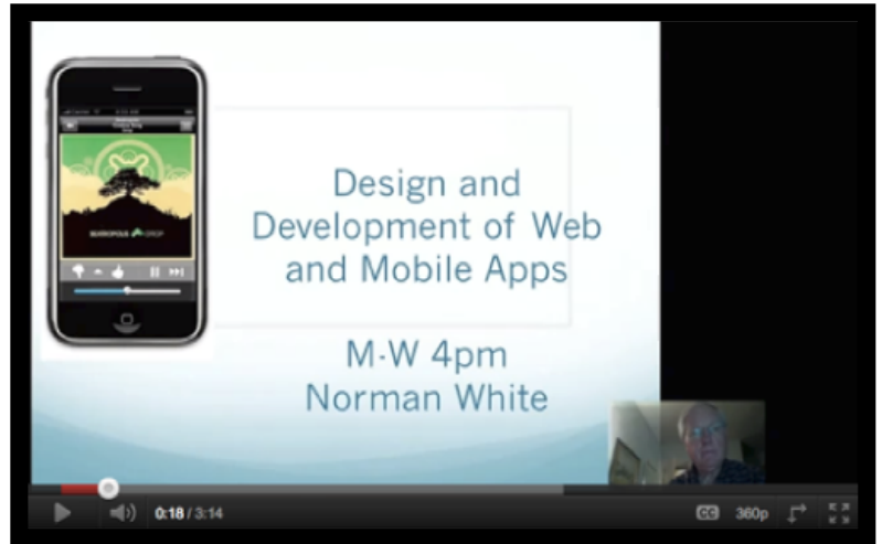
Figure 1. A video syllabus from Norman White's Web Based Systems course